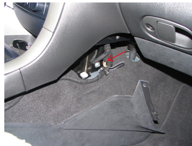
The picture show the location of the VDA connector in a Holden Monarco

1st: Locate the 6 way VDA plug. This can often be found behind the panel in the footwell at right side of the centre consol. Please see picture below.